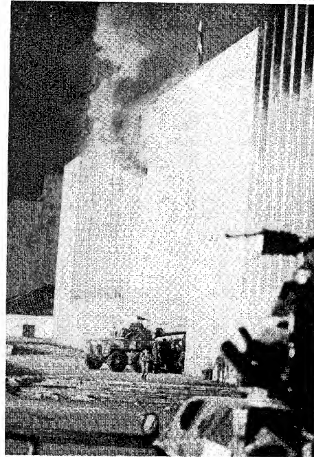
Colombian army attacks Palace of Justice with armored cars and cannons, November 7, 1985.

George Shultz repeated these allegations, ignoring the denial of the Colombian government itself.